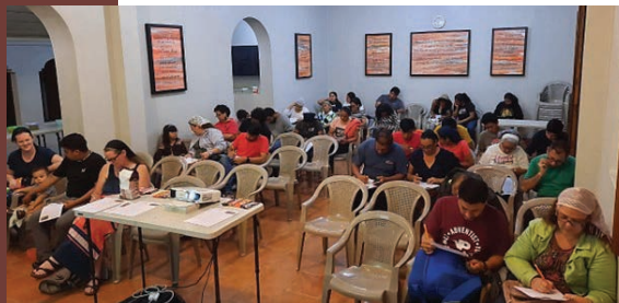
Right column (from top): Each day, the group leader sends out a reading reminder and survey; The participants meet monthly to review their progress and encourage each other.

We would reward the participants who had memorized the names and order of the 27 New Testament books and those who had answered the question-of-